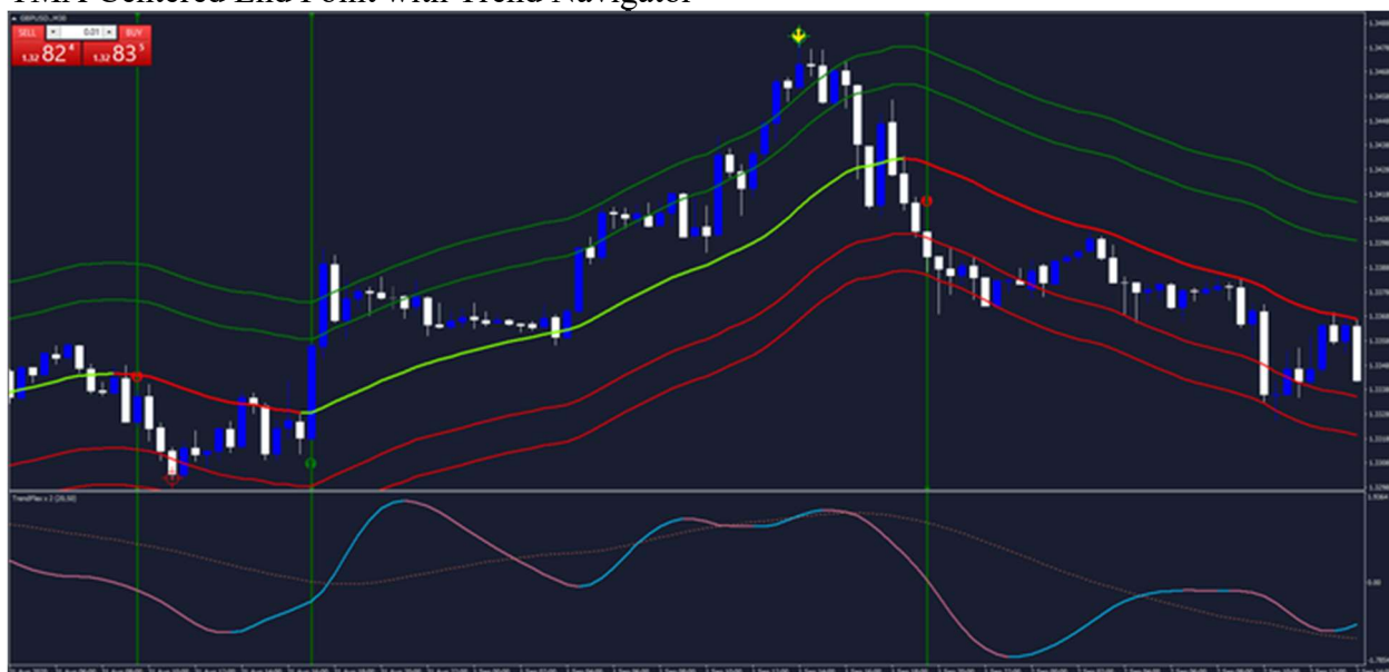
TMA Centered End Point with Trend Navigator