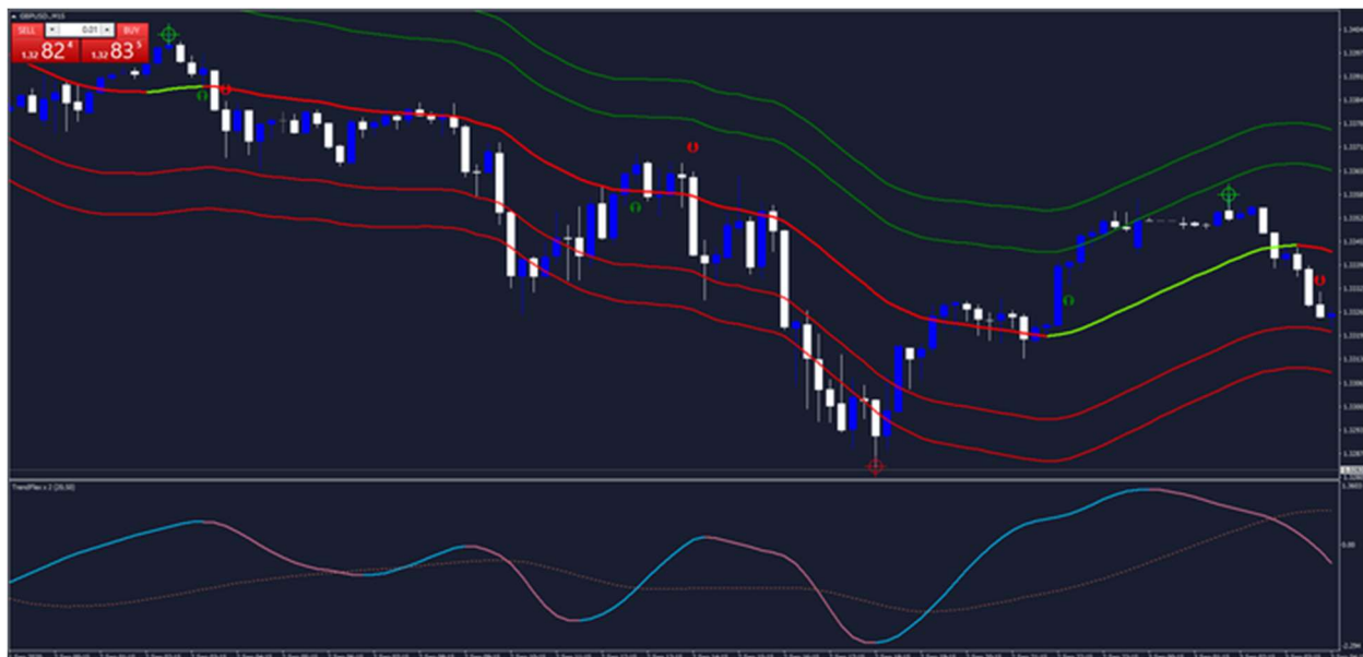
TMA Centered End Point with Trend Navigator