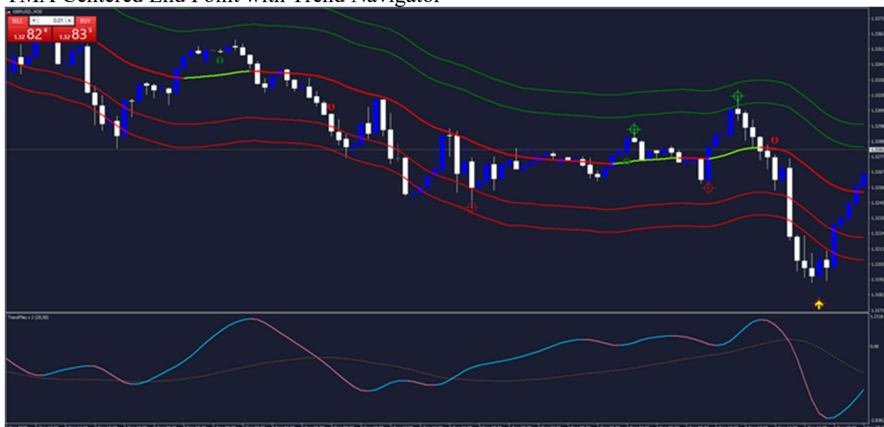
TMA Centered End Point with Trend Navigator